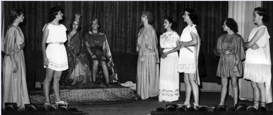
Midsummer's Night Dream