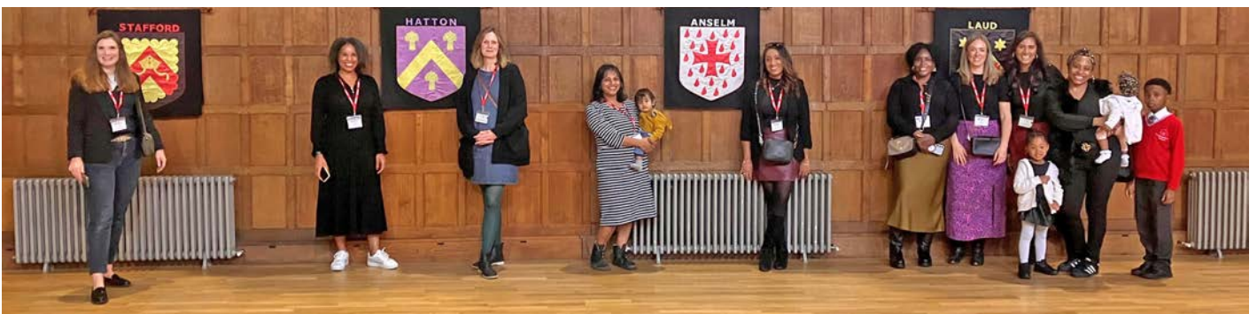
Class of 2002