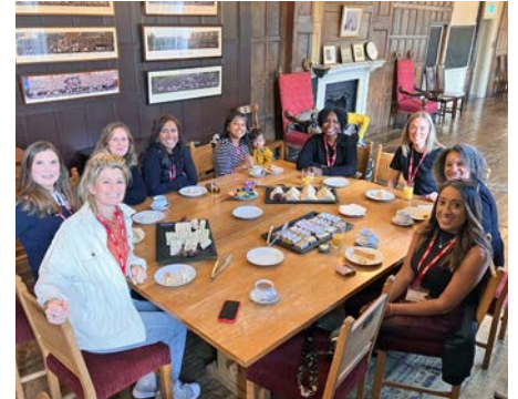
Class of 2002