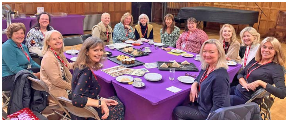
Class of 1982