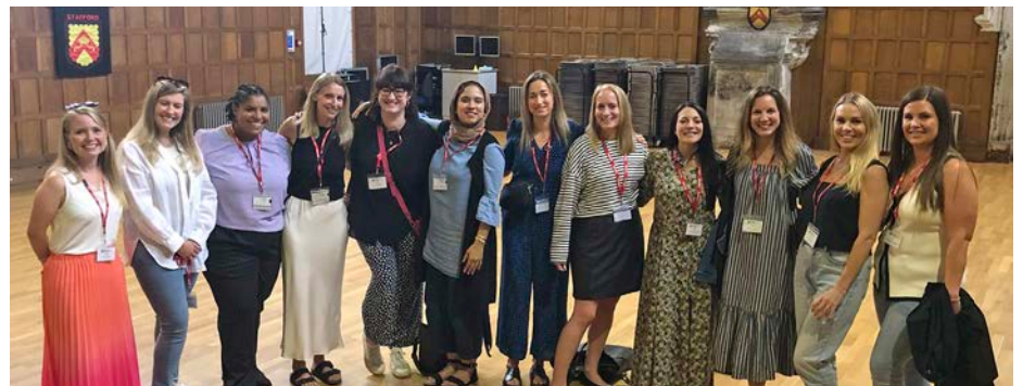
Class of 2002