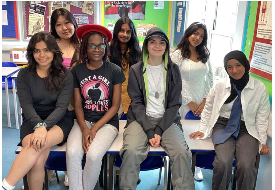
Please note that this photo was taken during the week where each day had a costume theme!

Well done to all. The PE department would like to wish them the very best of luck with their exams