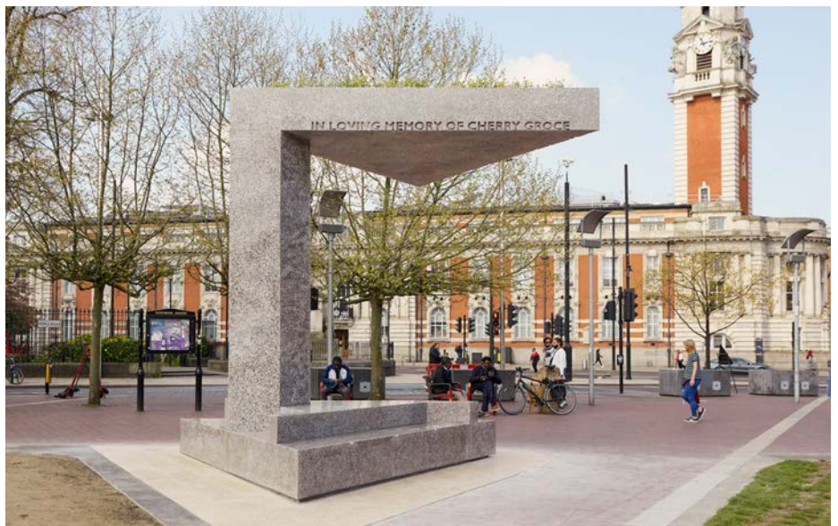
In memory of my Grandma there was a memorial put up in Brixton