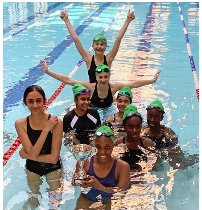
Winners - Hatton