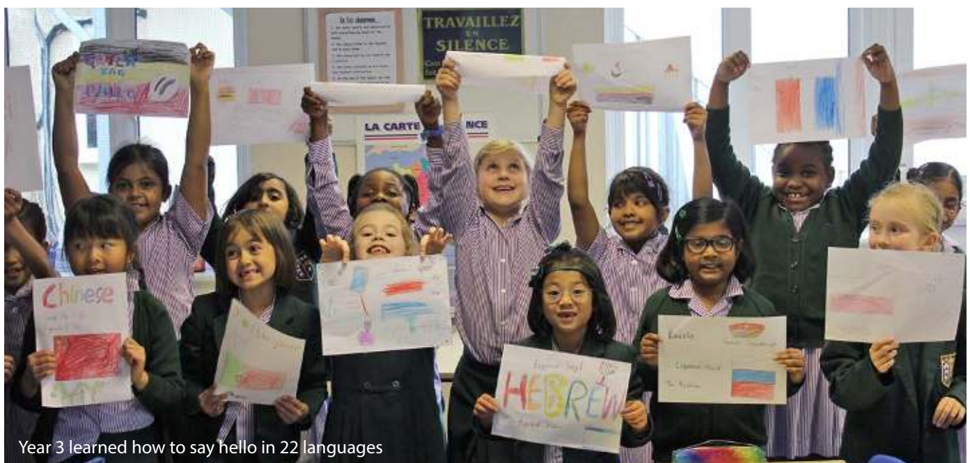
Year 3 learned how to say hello in 22 languages