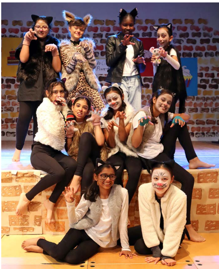
Year 5 & 6: Paws and Claws continued on pages 9-12