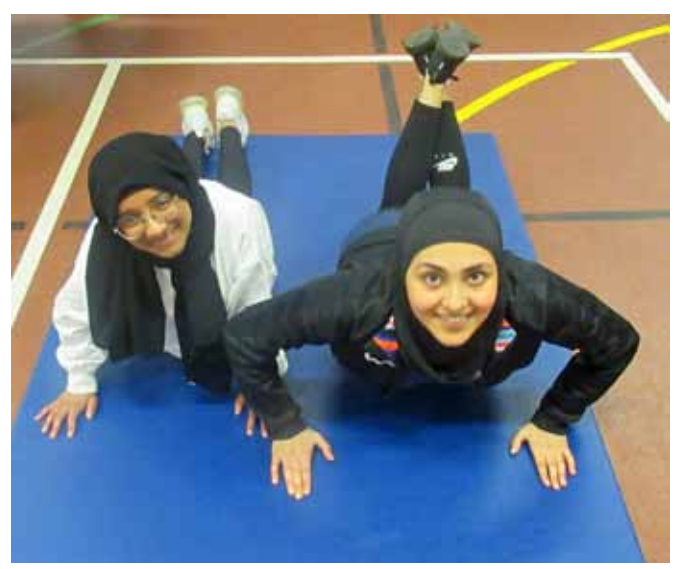
The Year 12 HAL groups had the opportunity to take part in Kick Boxing again this week.

They learnt some of the basic techniques and enjoyed throwing themselves into all of the activities.