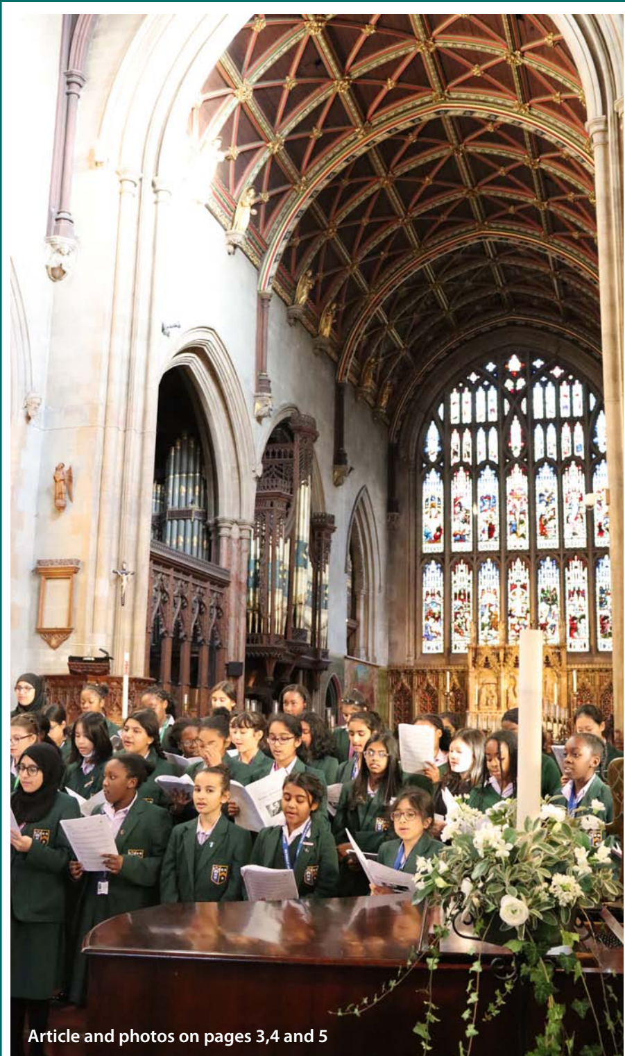
Article and photos on pages 3,4 and 5