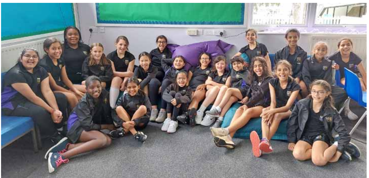
Year 6 had just one word to describe how they felt about their new Year 6 common room, and that was 'amazing!'