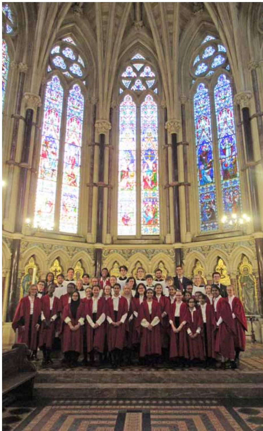
Article on page 4