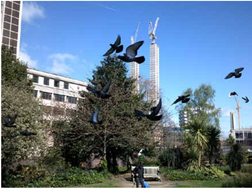
Atwood Primary School