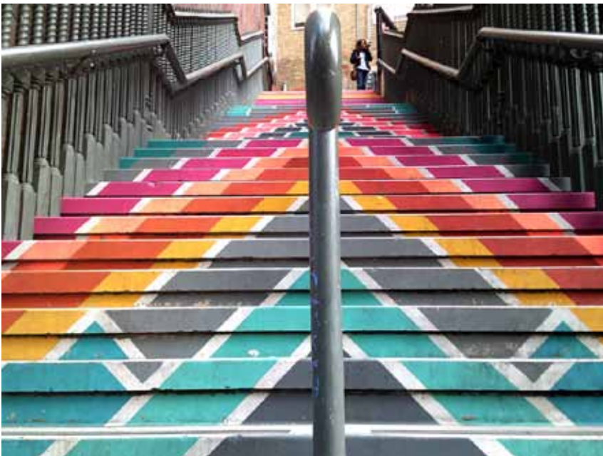
Fairchildes Primary School