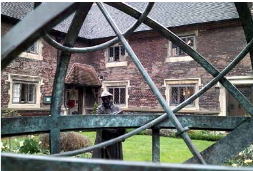
Howard Primary School

The Capturing Croydon Competition, a borough-wide initiative led by The Whitgift Foundation and sponsored by the Croydon Partnership, brought together 146 schoolchildren from local primary schools to try their eye at photography.