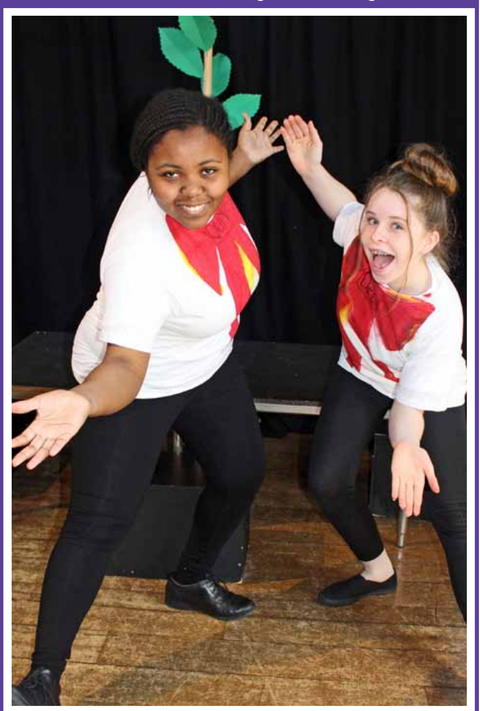
Last week, the Chapel was transformed into a world of magic and madness.