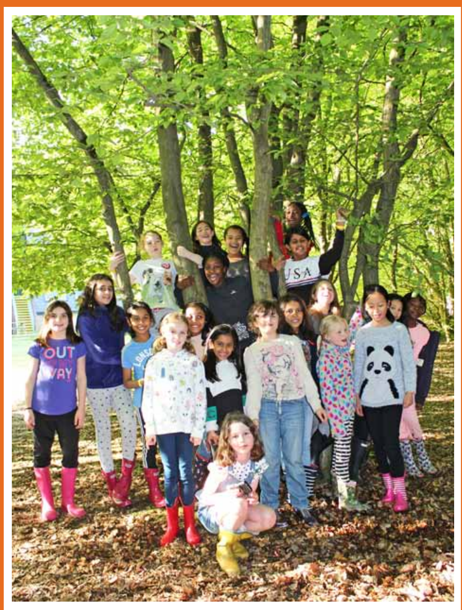
Article to follow in next week's bulletin.