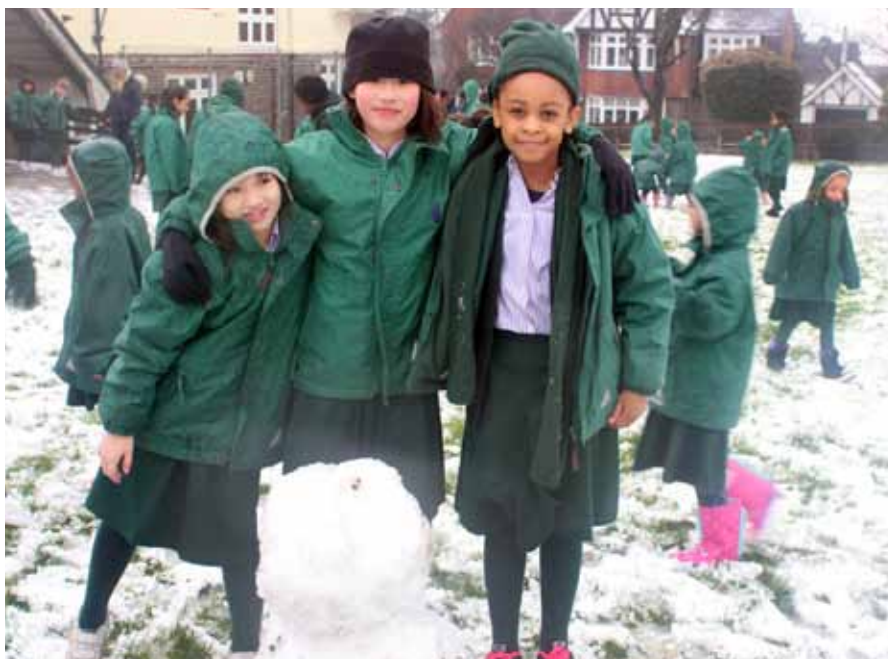
Pupils at Prep couldn't wait for break time today. Although the snow was a bit thin on the ground the children still managed to make some rather impressive snowpeople!